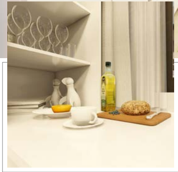
Composite countertop The kitchen boasts a Silestone counter top with an inset sink