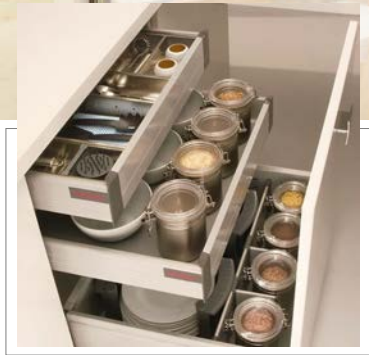
Solid wood cabinetry Kitchen cabinets are made from solid wood and have various storage features