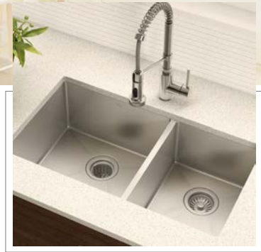
Premium quality fittings A high quality kitchen mixer faucet complements an inset sink